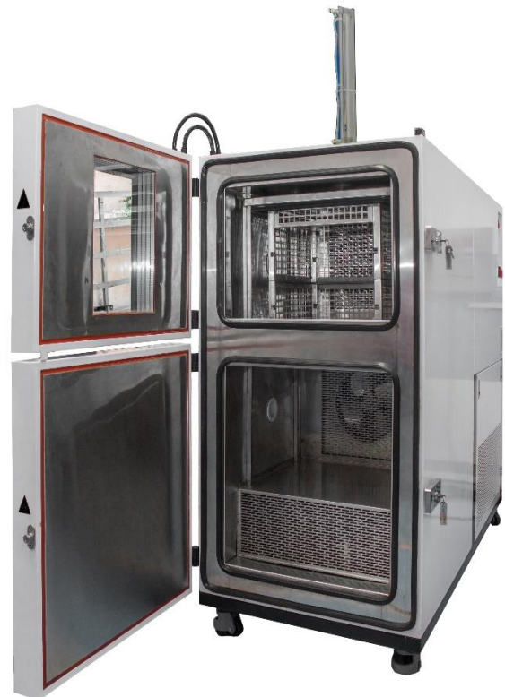
VERTICAL BASKET CHANGEOVER