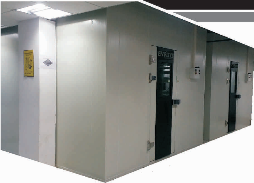
WALK-IN INDUSTRIAL BURN-IN CHAMBERS